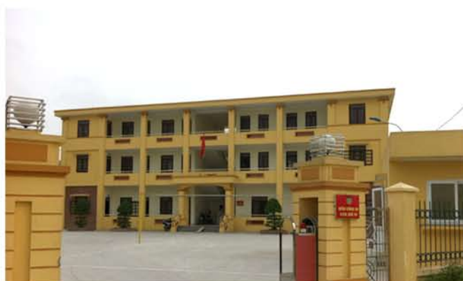
Police station in industrial parks

With the upgrade, Que Vo industrial park hopes that the business investment will satisfied not only the quality service but also infrastructure of industrial parks