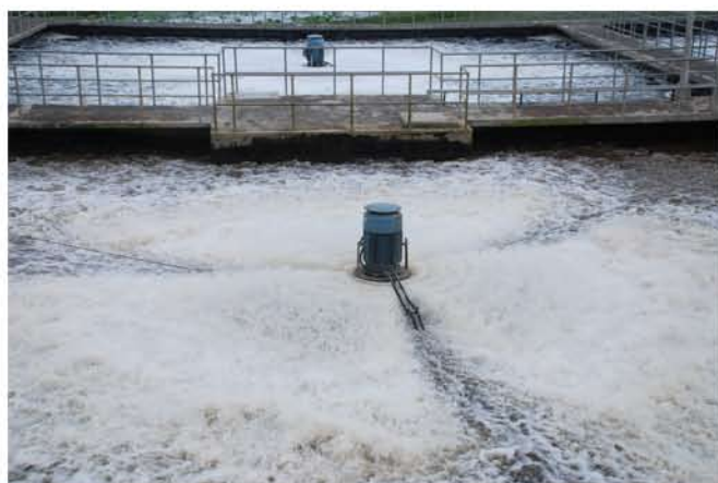
Water supply system plant is enhanced into level A according to Vietnam's standard

Ensuring safety, enhancing the quality service and Serve is set in industrial park