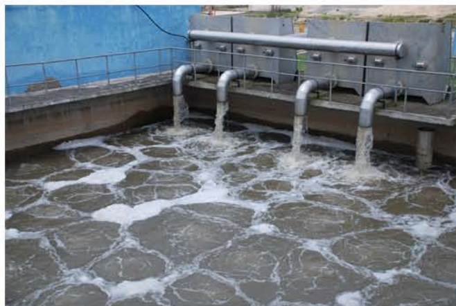
Completing the water supply system of industrial park

Besides, the lighting system in industrial park is attached special importance by the whole internal routes is lighted with the large capacity.