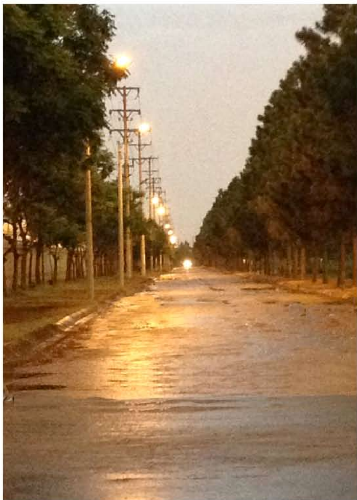
Enhancing the electricity supply system